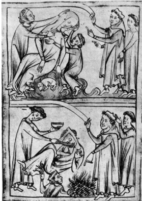
Pictured drawing depicts the death of St. Valentine — one of them, anyway. The Romans executed two men by that name on Feb. 14 of different years in the 3rd century A.D.