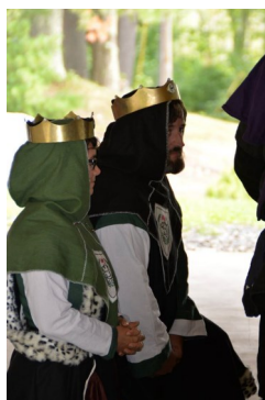
Kneeling before the King