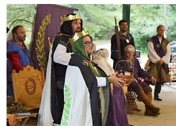
Gift for the Musicians