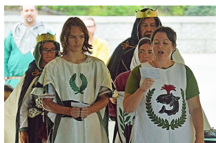
Marching in to Pavane