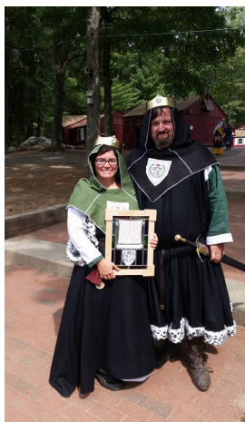
Their Excellencies of SR