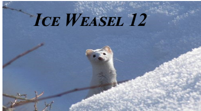
ICE WEASEL 12

The Infamous Ice Weasel returns for a 12th year. Don't miss this great event! Fighting in the snow, A&S classes, music. 12 Angry Weasels.. You can't ask for more in an event.