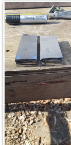
How it began...