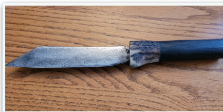
How it ended: 199 layers of metal!