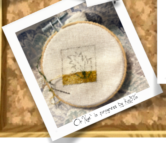
On 'Nee' in progress by Keelin