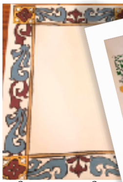
Scrolls by Baroness Sabina